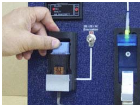
Place the cartridge to the evacuation station