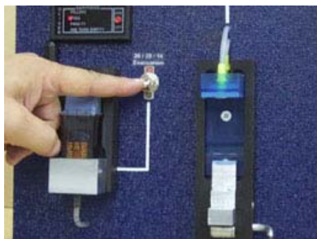
Switch On for Evacuation