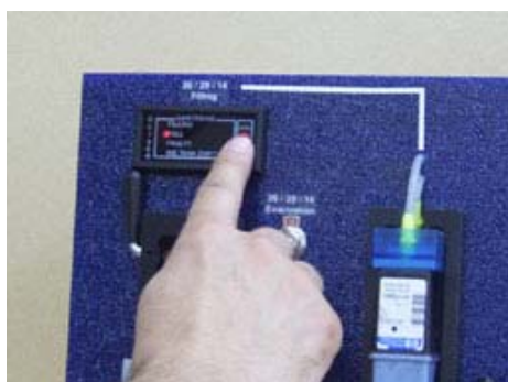
Push the Start / Stop button to start filling