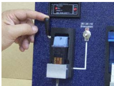
Be sure that the remaining ink is removed, and flip the handle down to take out the cartridge