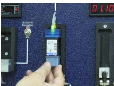
Place the cartridge to the filling station