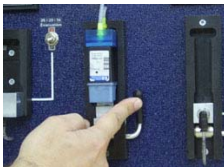
Flip the handle up to squeeze the cartridge