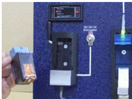
Take the cartridge out for starting filling operation